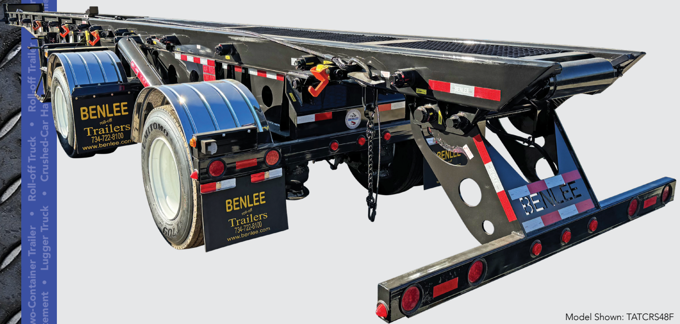
Model Shown: TATCRS48F

BENLEE delivers on its promise of safe operation, maximum uptime, and the lowest total cost of ownership in the industry. Choosing BENLEE means investing in proven durability, performance, and exceptional value.