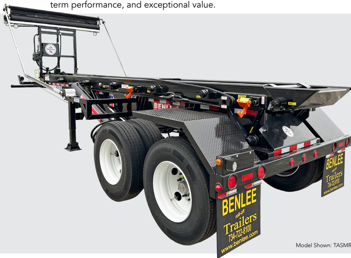
Model Shown: TASMR526S

BENLEE is synonymous with safe operation, maximum uptime, and the lowest total cost of ownership in the industry. Choosing BENLEE means investing in proven quality, long-term performance, and exceptional value.