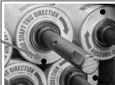
Industries Best Built Roller

"Tarp replacement time is dramatically reduced with the O'Brian roller line."