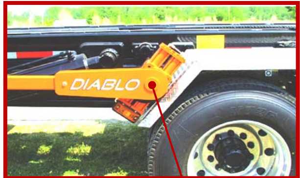
Pivot Point is below the container floor.

Fastest tarp replacement system on the market!