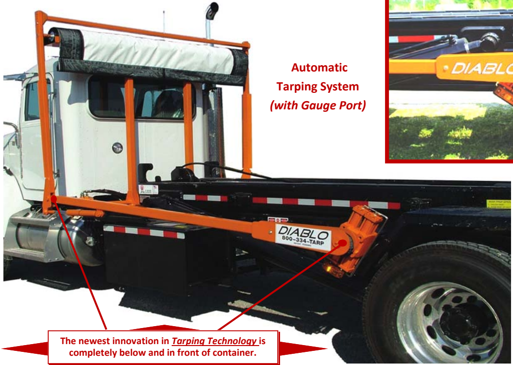
Automatic Tarping System (with Gauge Port)